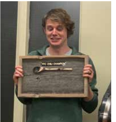
interactions with children and youth

Chili Cook Off Champion in the Inaugural Chili Feed Contest