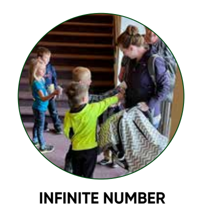
of hugs and handshakes given while serving as greeters