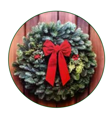
$668.35 in Christmas wreath sales to support the ministry of First Presbyterian Church