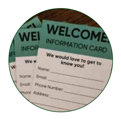
25+ WELCOME CARDS

New This Year! The Visitor Follow-Up Team focuses on connecting with people who visit on a Sunday morning