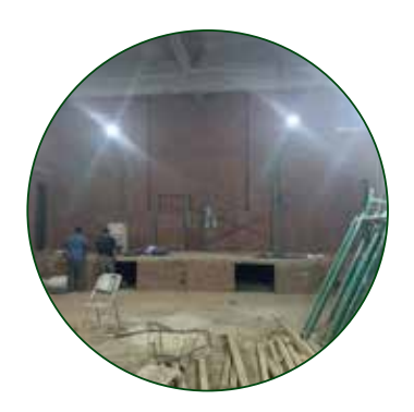
$400 to support New Church Development in Egypt