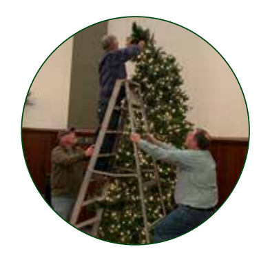
2ND ANNUAL DECK THE HALLS

donating 209 pounds of food and supplies to Community Cupboard