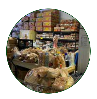
500+ POUNDS donated to the Community Cupboard following our collections on the 1st Sunday of each month