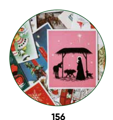
Christmas cards sent to congregation members and friends