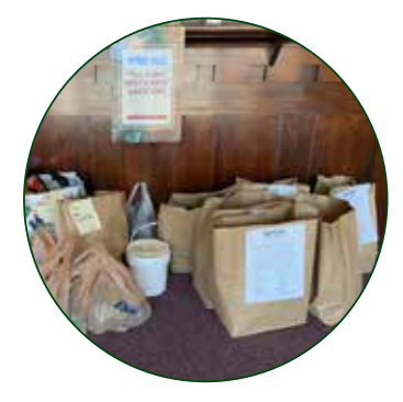
15+ BAGS stuffed with donations to bless families during the Christmas season for Love INC.