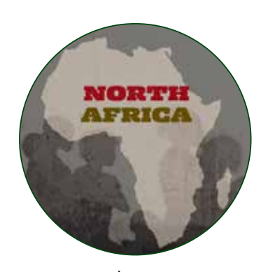
$800 to support Emalie K.'s work in North Africa with CRU