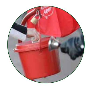
18 HOURS ringing the bell in support of Salvation Army's Red Kettle Drive